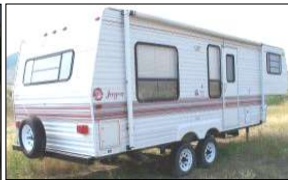
1995 JAYCO 26FT 5th-WHEEL TRAILER—Clean! With reversed axels for extra ground clearance!