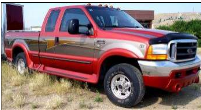
1999 F350 FORD POWERSTROKE 7.3 DIESEL 4x4 PICKUP ONE OF A KIND! Shortbed, Lariat Edition w/ only 100,000 miles! 'Billy Blue' Chipped. Custom Paint. New Automatic Transmission. Extra Clean Truck in Excellent Condition!