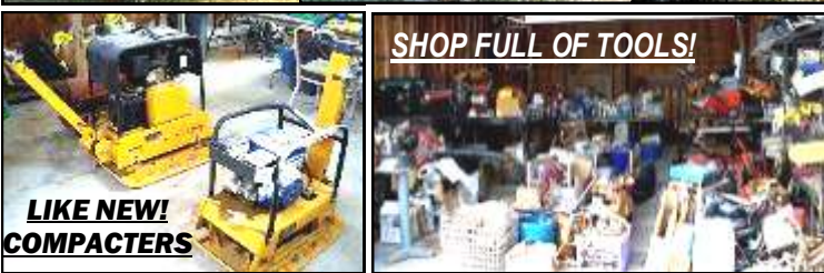
SHOP FULL OF TOOLS!