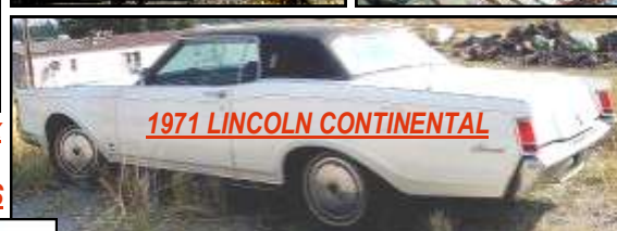
1971 LINCOLN CONTINENTAL