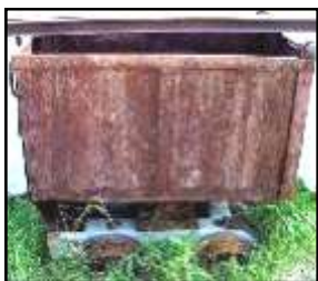
MINING CART W/ WHEELS & TRACK!