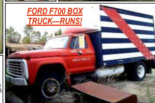
FORD F700 BOX TRUCK—RUNS!