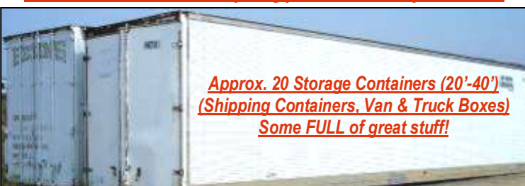
Approx. 20 Storage Containers (20'-40') (Shipping Containers, Van & Truck Boxes) Some FULL of great stuff!