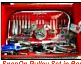
SnapOn Pulley Set in Box