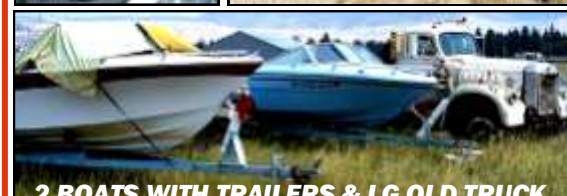
2 BOATS WITH TRAILERS & LG OLD TRUCK

PAYMENT TERMS: (We do not accept plastic of any kind.) We accept only CASH or PRE-APPROVED CHECKS for purchases of $2000 or more from buyers without a good history at Hagedorn Auction. For Buyers with a good history, checks for $5000 or more must also be PRE-APPROVED . For check pre-approval you must submit a BANK LETTER OF GUARANTEE (you can find an example letter on our website) from your bank no later than noon Sept. 14th GUARANTEEING payment up to the maximum amount they will guarantee for you (choose an amt. above what you think you MAY spend). If not submitted in time, you may still purchase items by check but you will not be able to take your larger items with you on auction day & will be required to wire your payment in full to our account Monday morning. After wired payment is received you can pick up your items & the physical check you wrote auction day will be destroyed.