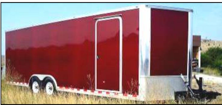
2009 CAR HAULER ENCLOSED 28' TRAILER— Like New! Has interior winch too! Everything you need to haul your babies!